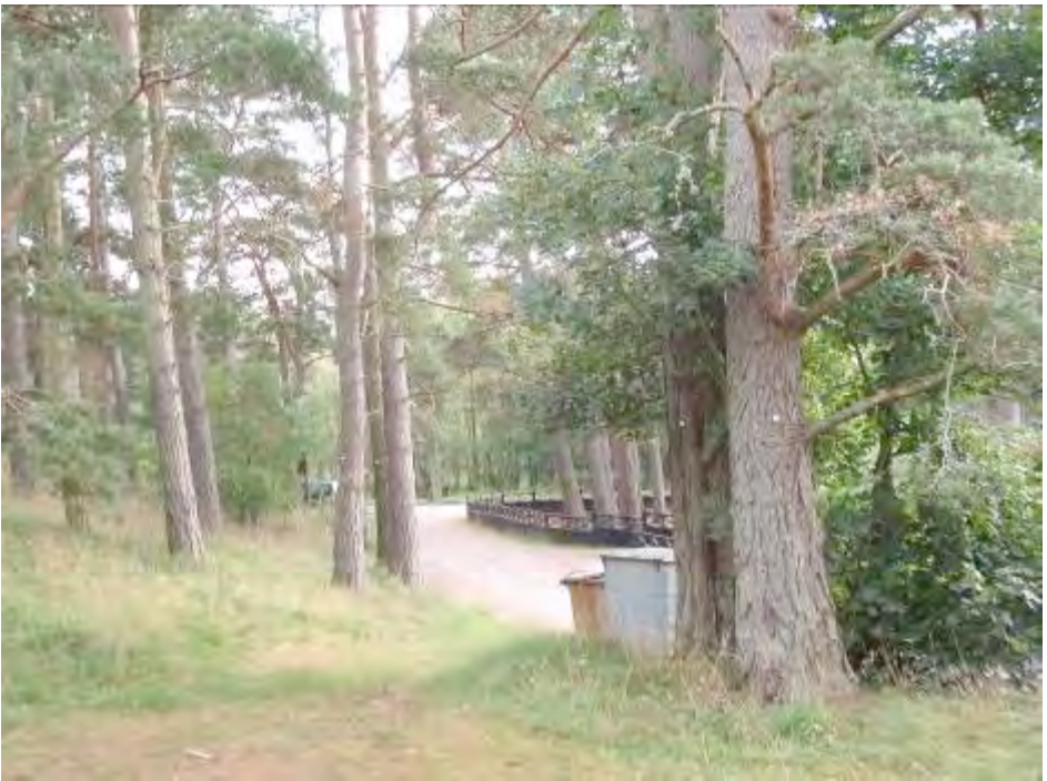
Fig. 5 View of site entrance (B970 in background)