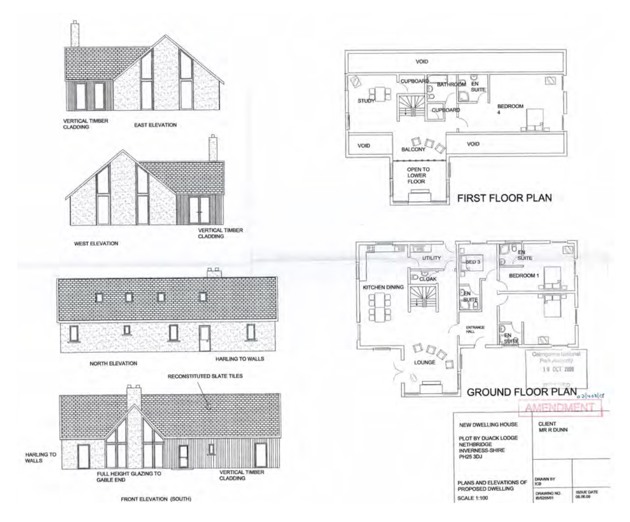
Fig. 7 – Elevations/Floor Plans