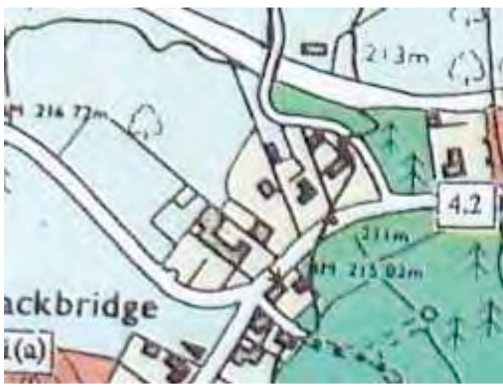
Fig. 8 : Extract from Badenoch and Strathspey Local Plan (1997) – Settlement Map 4, Nethy Bridge (site is dark green area left and above 4.2).