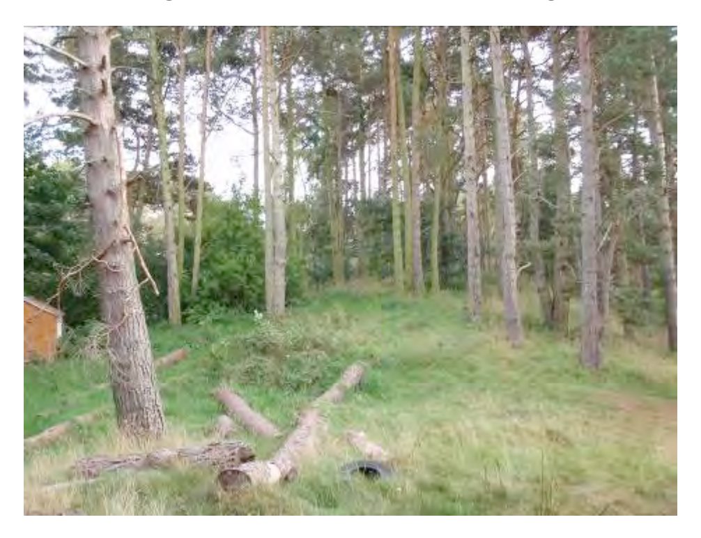
Fig 4. View of site indicated for dwelling (in foreground)