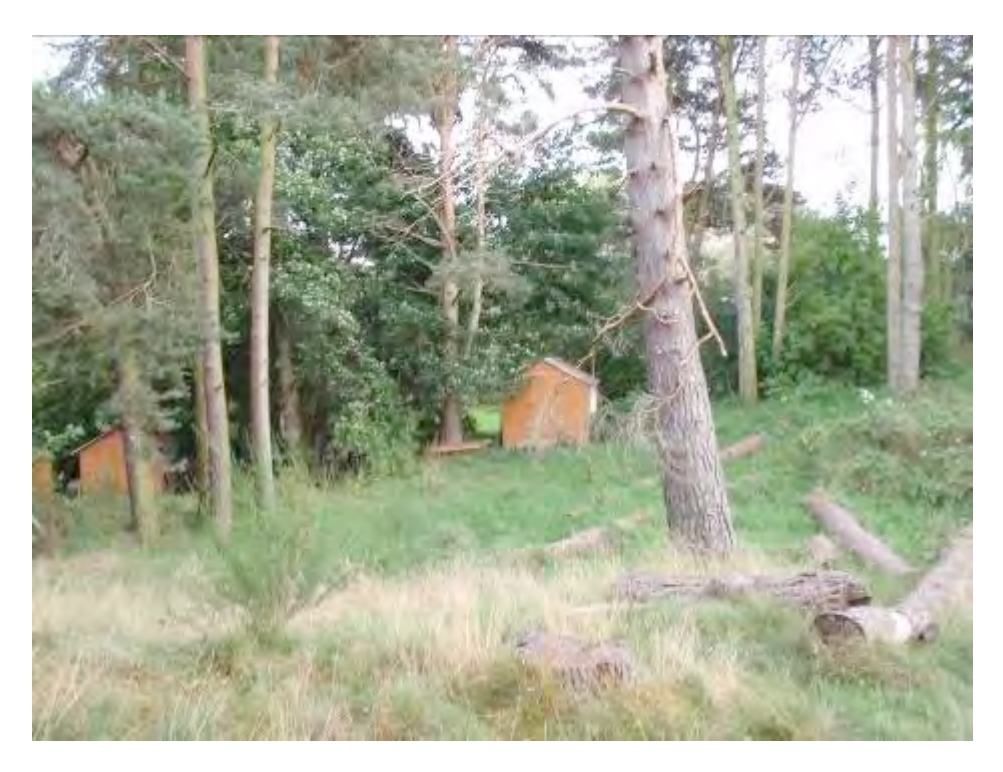
Fig 3. View of site indicated for dwelling