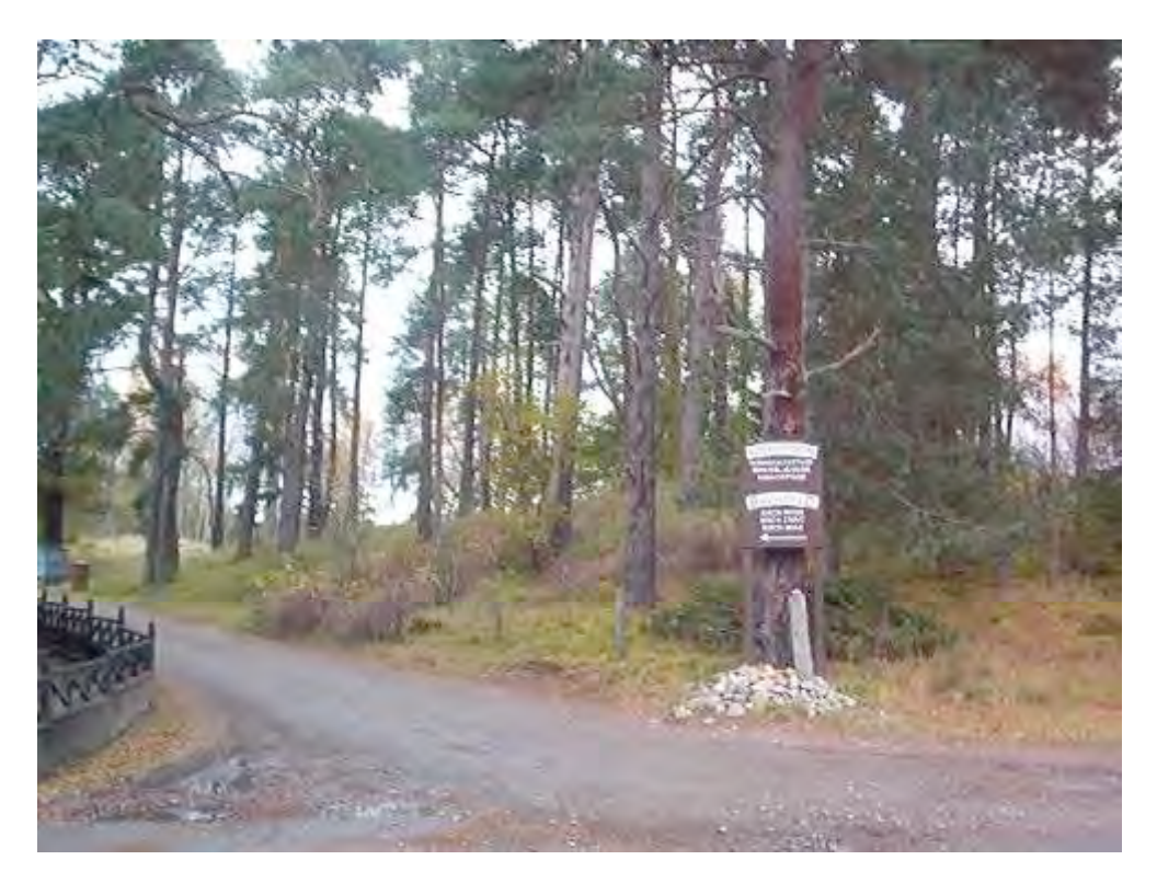
Fig. 2 Access to site from B970, the access to the site itself is on left of photo at 'wheelie bin'